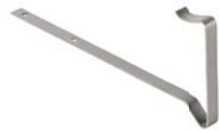
Grampian/Highland S/S Verge Clip