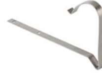
Double Roman/Pennine S/S Verge Clip