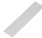
Ridge Batten Connector x10