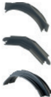
Uni Angle Multi Half Round RussFast Ridge Union x10