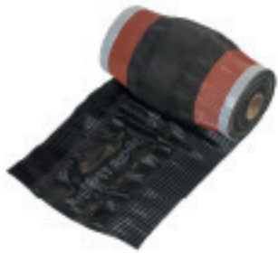
RussFast Ridge Roll 5m Ventilated or Unventilated