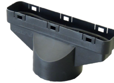
RussVent Adaptor (available separately)