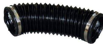
110mm Flexi Pipe (available separately)

The RussVent is designed to offer architects and specifiers all the practicalities of roof ventilation with the aesthetics and ease of installation of a normal tile. RussVent is designed for ventilation of the roof space. It can also be used as a soil vent pipe (SVP) or mechanical extract terminal.